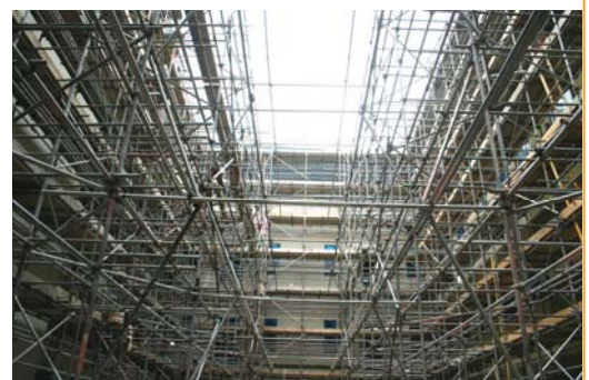
BALFOUR BEATTY: HOPE HOSPITAL, MANCHESTER (above)