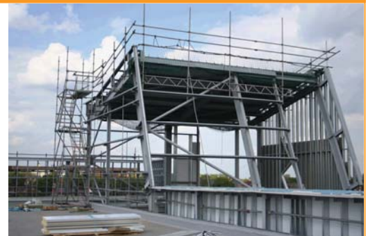
SHEPHERD CONSTRUCTION: TRINITY WALK, WAKEFIELD (above)