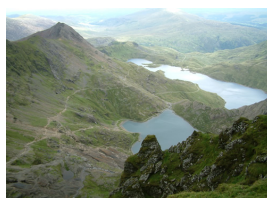
(Snowdon—1,085 metres high)

If you are interested in being involved in any way, please contact Laura Brandon for full details.