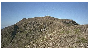
(Scafell Pike—978 metres high)

The aim is to raise funds for Care International, a charity working with over 45 million disadvantaged people each year in 70 of the world's poorest countries.